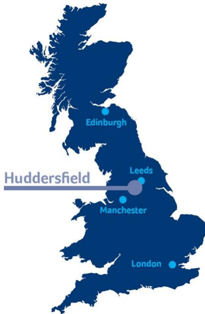
Figure 1. Map of UK showing location of University of Huddersfield.

The University of Huddersfield is a publicly funded university in West Yorkshire, England. The town of Huddersfield is located in the centre of a triangle formed by the better-known cities of Leeds, Manchester and Sheffield, and is in the heart of what is currently referred to by the UK government as the ‘Northern Powerhouse’ (see figure 1) 1 .